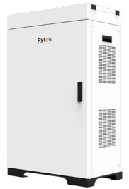
Forest RB Plus hold up 6*E-BOX 48100R