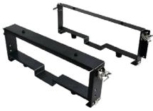
48100R Bracket hold up 1*E-BOX 48100R