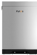
R-BOX-NEMA3 hold up 2*E-BOX 48100R